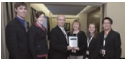
Honourable Bill Bennett presented the award to Thompson Rivers University, winner of LinkBC's 2009 Student Case Competition, Degree category.