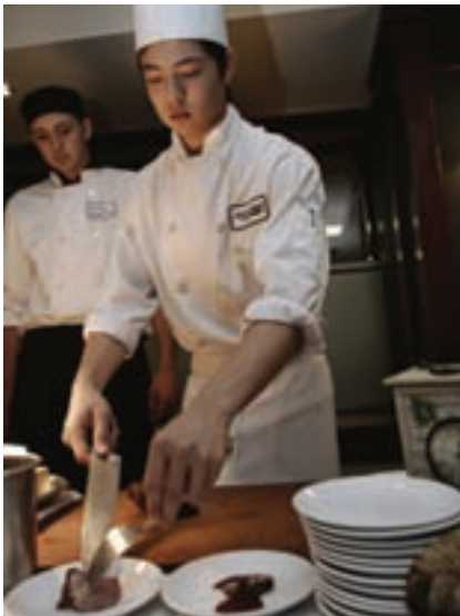
Students from Vancouver Community College's culinary program prepare food for the new Cook Program launch.