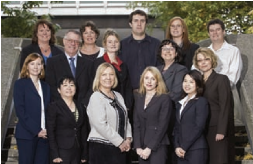
The go2 Team

With go2's mandate to help the tourism industry recruit, train and retain employees by using best HR practices, the organization is always looking for ways to improve and lead by example. This year, go2 implemented a formalized Employer of Choice plan. Overseen by a joint employee/management committee and based on employee surveys, some new additions this year included an RRSP matching plan and a transit and fitness subsidy.