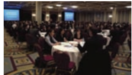
Over 400 tourism and hospitality students meet with almost 60 managers representing Vancouver-area hotels at LinkBC's Student-Industry Rendezvous.